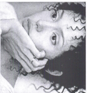
A Mighty Heart. Clipped. Blunt, and Grimly Realistic

'The Next Harry Potter' Ignites the Next Hollywood Freak-Out