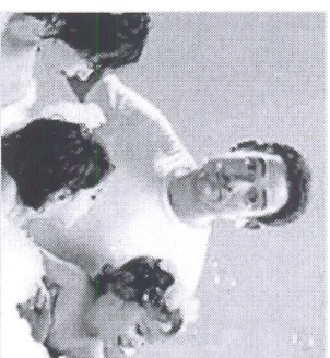
• Confessions of a Real-Life Children's "Manny"