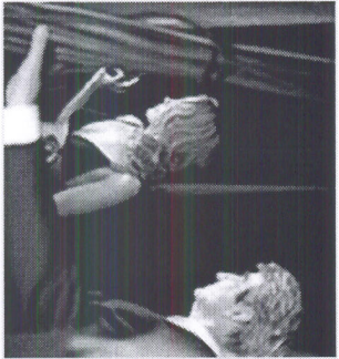
Backstage at the Beleaguered, But Still Fabulous, Tonys